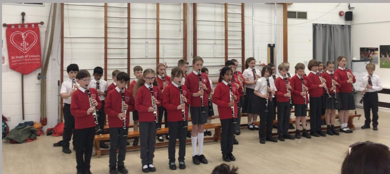
Year 5 Clarinet performance