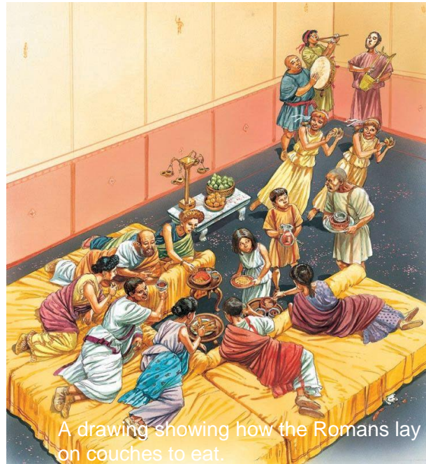
A drawing showing how the Romans lay on couches to eat.

Rich Romans held elaborate dinner parties in the triclinium (dining room). These parties often lasted up to eight hours. The adults lay on sloping couches. The Romans ate mainly with their fingers and so the food was cut into bite size pieces. Slaves would continually wash the guests' hands throughout the dinner.