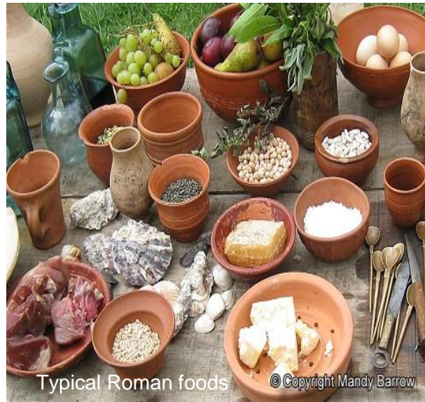
Typical Roman foods