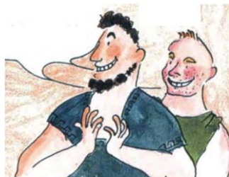
Corinthus and Candidus are slaves