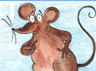
Minimus is the mouse