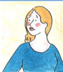
Pandora is a slave