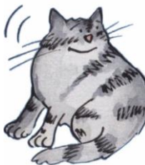
Vibrissa is the cat