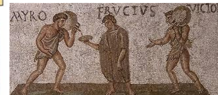
Mosaic showing two slaves serving wine to a man.

Greek slaves especially were in high demand because they were well educated. Skilled slaves were allowed to earn money and keep it.