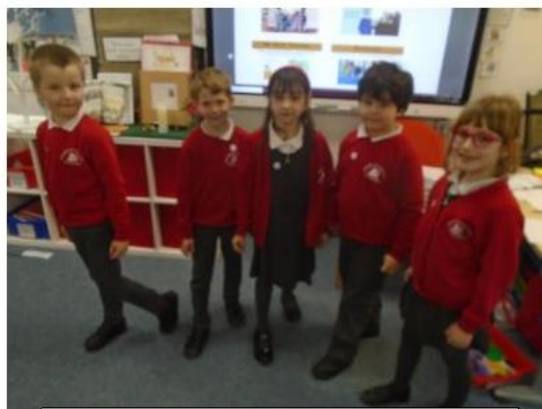
We go out