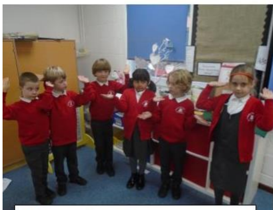
We give thanks