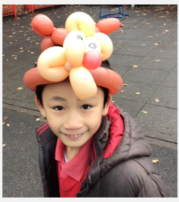
Thank you for your support for The Royal British Legion and The Poppy Appeal. We raised £50.00 more than last year!

Our winners were presented with their certificates and prizes in our end of term assembly on Monday.