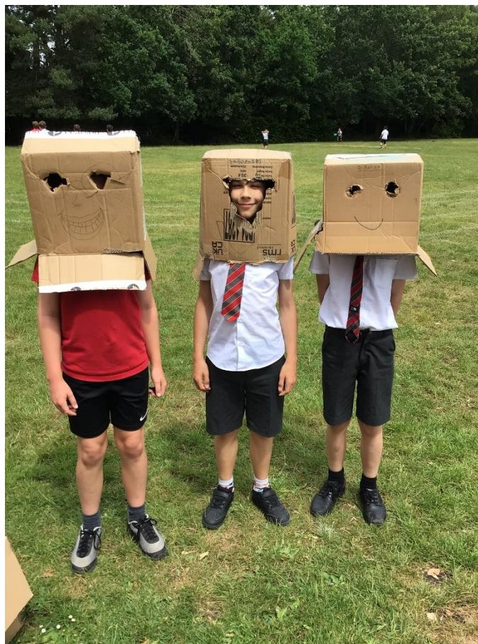
Curiosity Corner club on the field